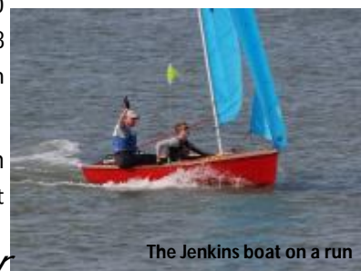
The Jenkins boat on a run