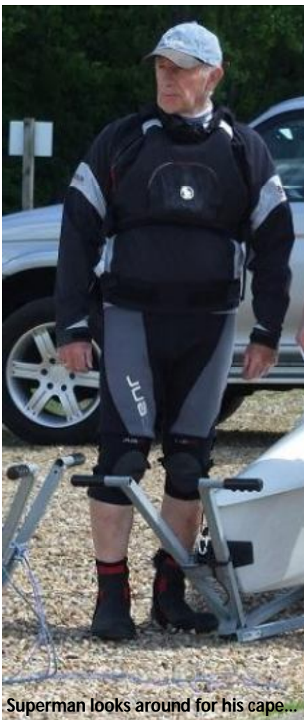
Superman looks around for his cape...

See page 14 for Notice of the AGM together with a draft agenda.